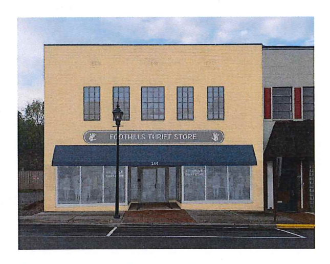
Proposed Front Facade