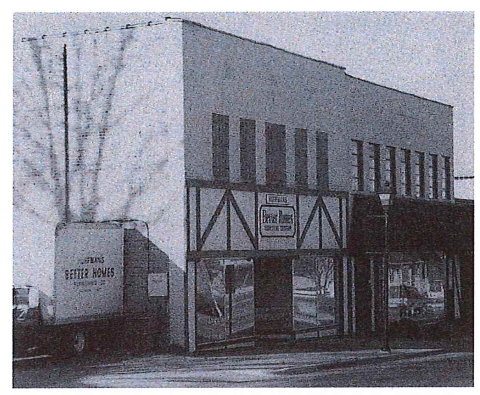
Archival image included with application, provided by Morrissa Angi.

There is currently no archival information available on this building.