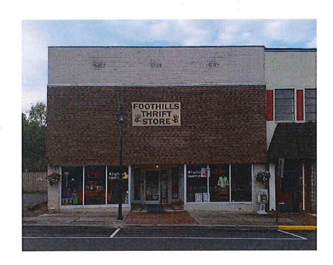
Existing Front Facade